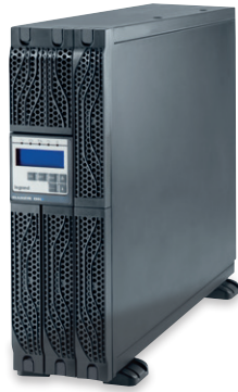
3 101 77